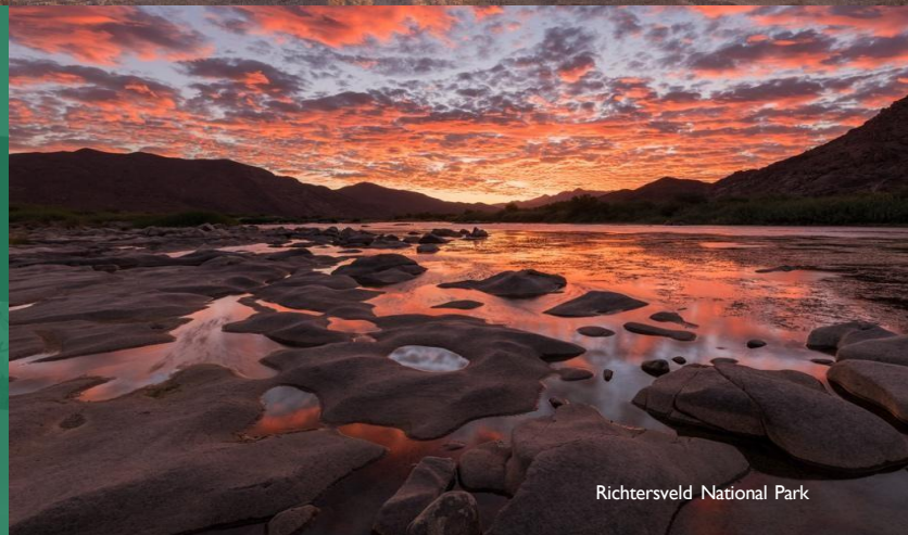
Richtersveld National Park