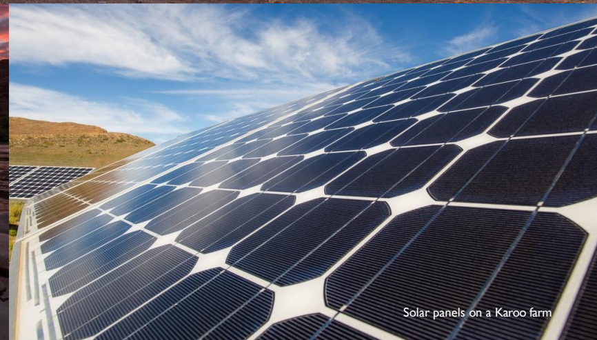
Solar panels on a Karoo farm