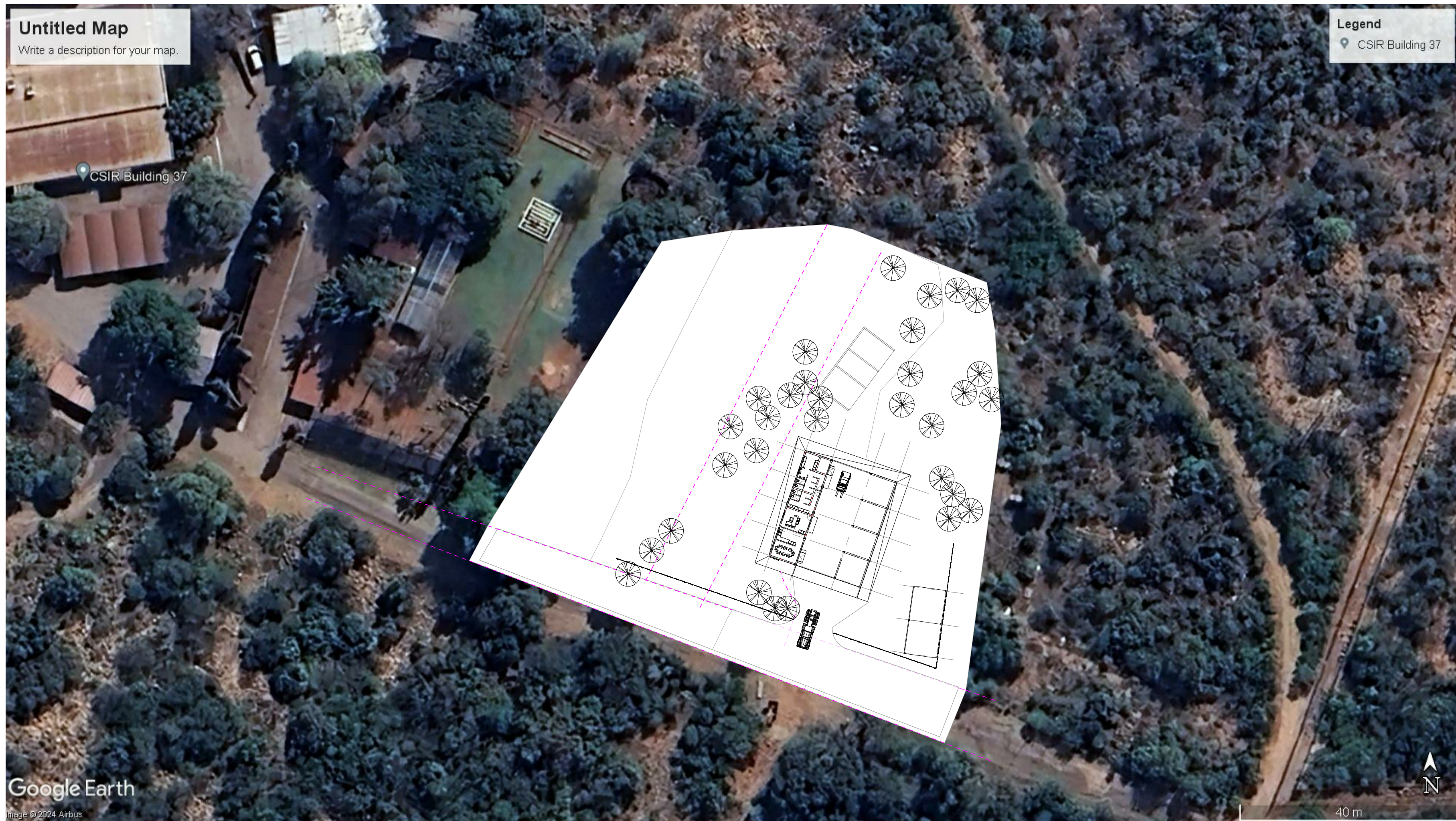
PROPOSED SITE LAYOUT PLAN